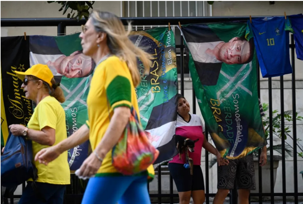
Supporters of former Brazilian President Jair Bolsonaro walk past flags with a portrait of tech tycoon Elon Musk during a rally.

In Australia , the eSafety commissioner ordered Musk's X to take down tweets that shared videos of a stabbing incident in Sydney in April. X only hid the posts from viewers in Australia , prompting the commissioner to bring a court case seeking an injunction. Musk faces fines upwards of AU$700,000 ($460,000) per day for each day the posts are online since the order was issued. The Australian Prime Minister has since lambasted Musk for being an "arrogant billionaire who thinks he is above the law."